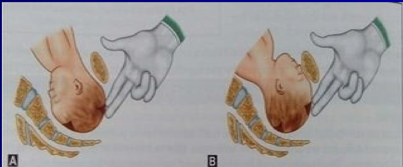
A B Figs 25.3A and B: Diagnosis of the attitude of the head—(A) Occipitoanterior—well flexed head—posterior fontanelle easily felt; (B) Occipitoposterior—deflexed head—anterior fontanelle easily felt.